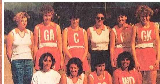
B grade, Premiers '85