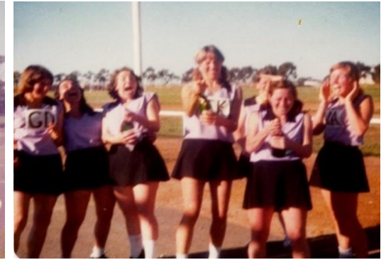
A grade R/up, '88