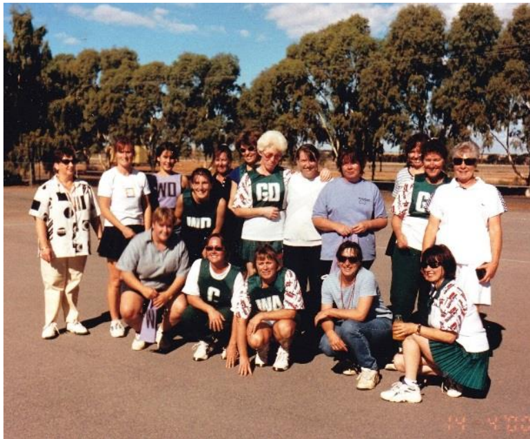
Teams in 2000...