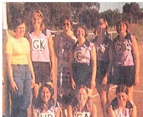
Jacarandas Premiers, A grade, '78